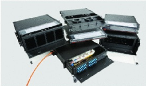
RTC/RTS fiber optic enclosures designed for easy installations