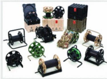
MARS® – numerous options for deploying field communication systems