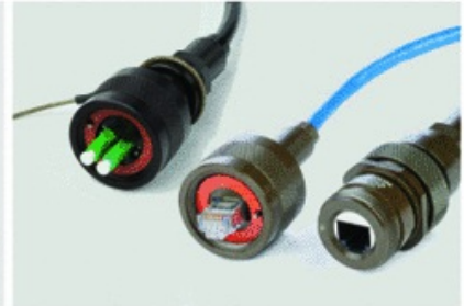
Robust connections for fiber or copper installations

OCC began by revolutionizing the fiber optic cable industry. Today, OCC is changing the way the world communicates.