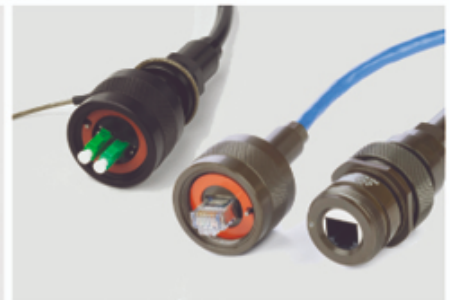
Robust connections for fiber or copper installations

OCC began by revolutionizing the fiber optic cable industry. Today, OCC is changing the way the world communicates.