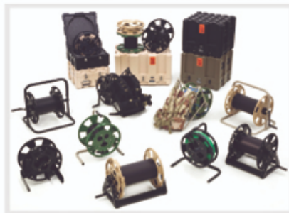
MARS® – numerous options for deploying field communication systems