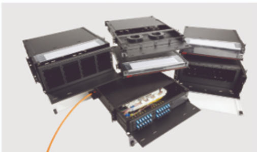
RTC/RTS fiber optic enclosures designed for easy installations