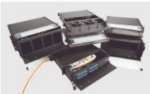
RTC/RTS fiber optic enclosures designed for easy installations