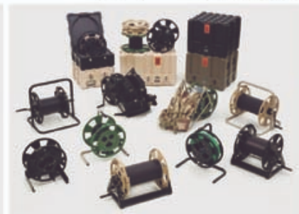
MARS® – numerous options for deploying field communication systems